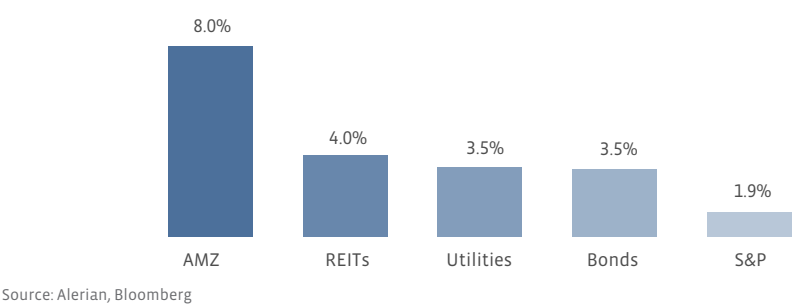
MLPs Offer More Attractive Yields Than Utilities and REITs

It's important to point out that each scenario of rising interest rates will have its own nuances. Relative to the periods shown above, the 10-year Treasury yield in October 2018 of more than 3.0% is at a higher absolute level, creating more potential competition for yield. On the other hand, MLP yields are also at higher levels in 2018 than they were for the time periods in 2013 (5.8%) and 2016 (7.3%). MLPs' higher yield may help insulate them from the impact of rising rates. MLPs also boast a more attractive yield than Utilities and REITs as shown below.