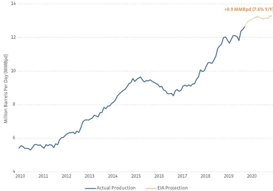
US Crude Production Since 2010