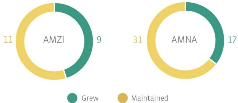
3Q19 Was a Cut-Free Quarter for the AMZI and AMNA